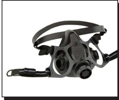
North 7700 Series Half Mask "The industry standard"