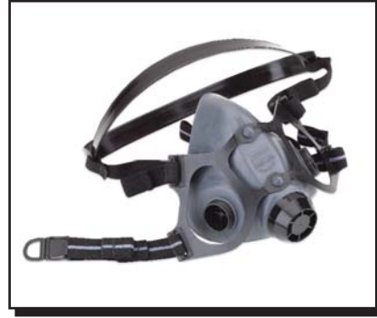
North 5500 Series Half Mask "The economical alternative"